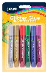
BOSTIK GLITTER GLUE